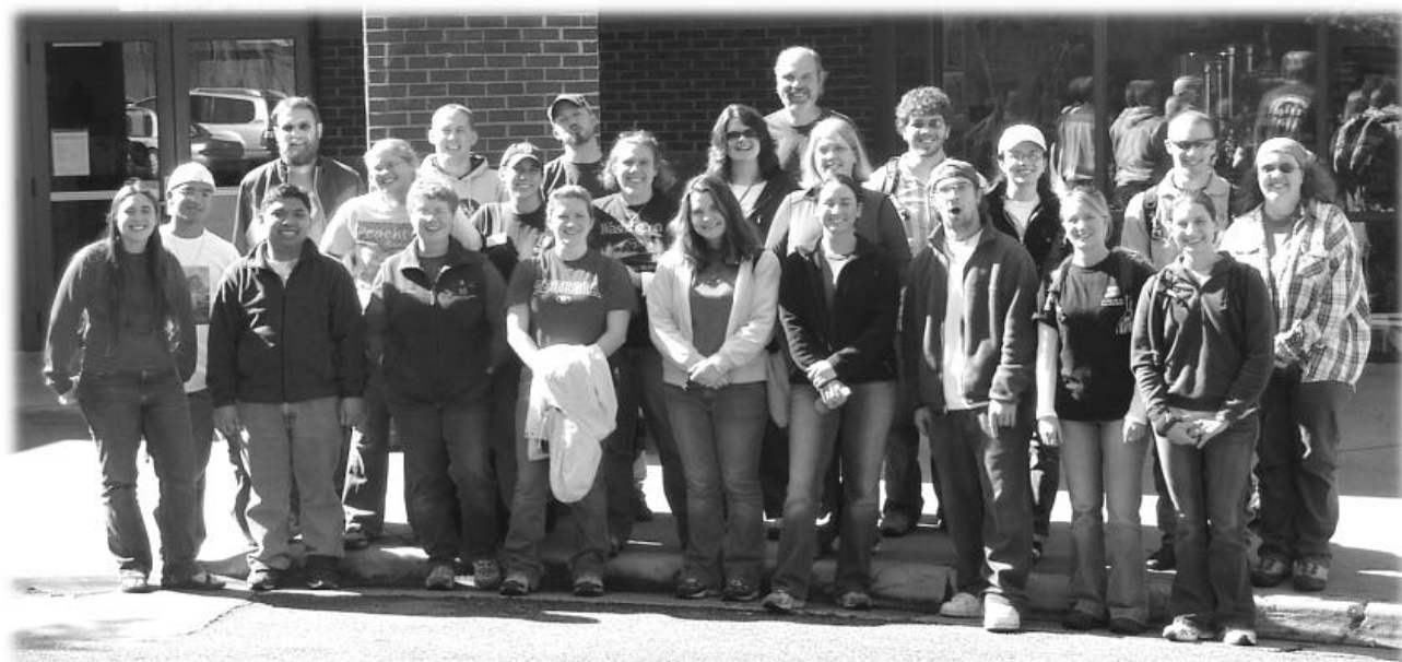
The Rock Eagle EE Spring 2006 Staff visiting the Macon Museum of Arts & Sciences.